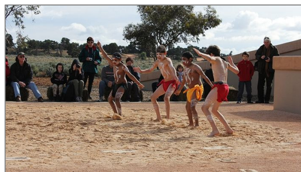
Picture: Performance by Traditional Dancers