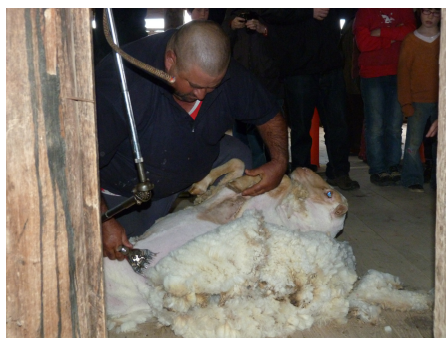
Picture: Shearing Demonstration

Celebrations concluded on the Friday with more Discovery Tours. Next years NAIDOC week celebrations will be bigger and better, so keep an eye on the www.visitmungo.com website for current news and upcoming events at Mungo National Park.