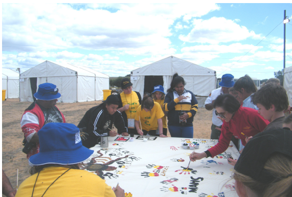
Governor of NSW Prof Marie Bashir painting with some of the students