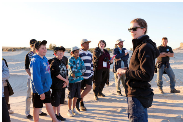
Picture: Student archaeologist conducting tour with students

The Elders & planning group believe that this Project comes to “the Heart of the Story” and is a model of ownership and participation of value to the education for all students across Australia through their World Heritage communities. Students develop valuable experiences that will assist in further education, job seeking efforts, employment skills and increased motivation, which in turn, will have the potential to increase education and employment outcomes.