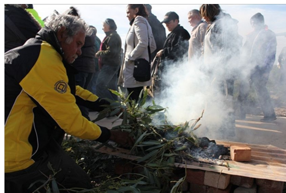
Picture: Traditional smoking ceremony