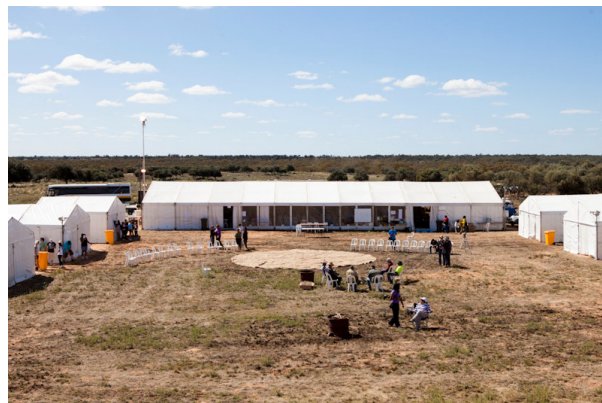
Picture: Section of the tent village

A specially constructed high tech, tent village was constructed to accommodate over 300 people. IT support was also provided for the students presentations enabling live online participation of six remote Inuit schools in Alaska.