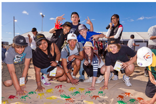
Picture: Students lending a hand