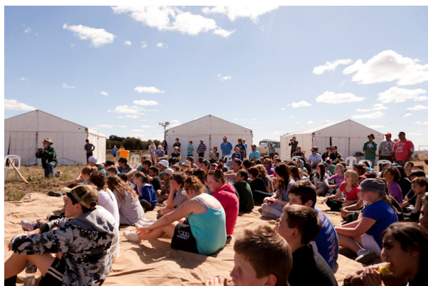
Picture: Captivated students