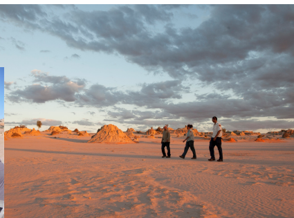
Discovery Rangers taking a tour