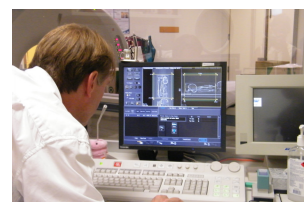
Above: Scanning in progress