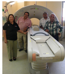
Right: Elders standing beside the CT scanner